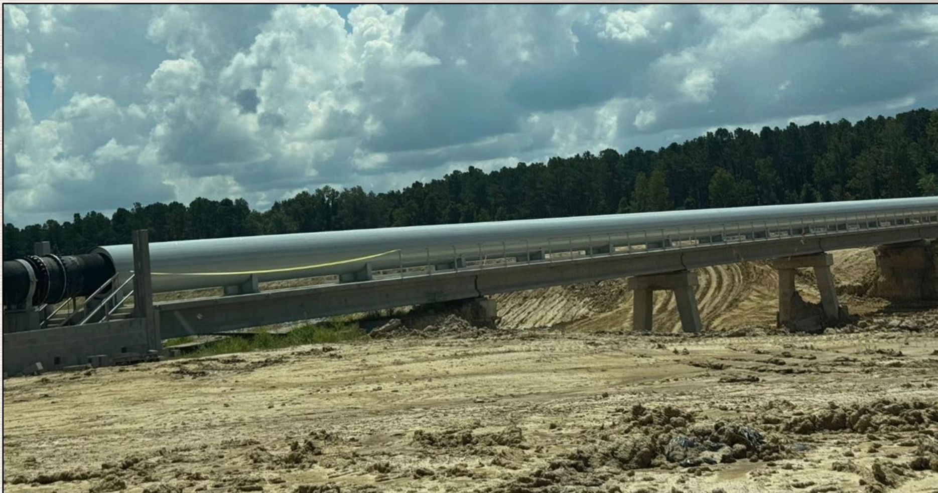
Channel Segment 1 – Completed East Baton Rouge 48” diameter (with a 64” casing) forced sewer main relocation