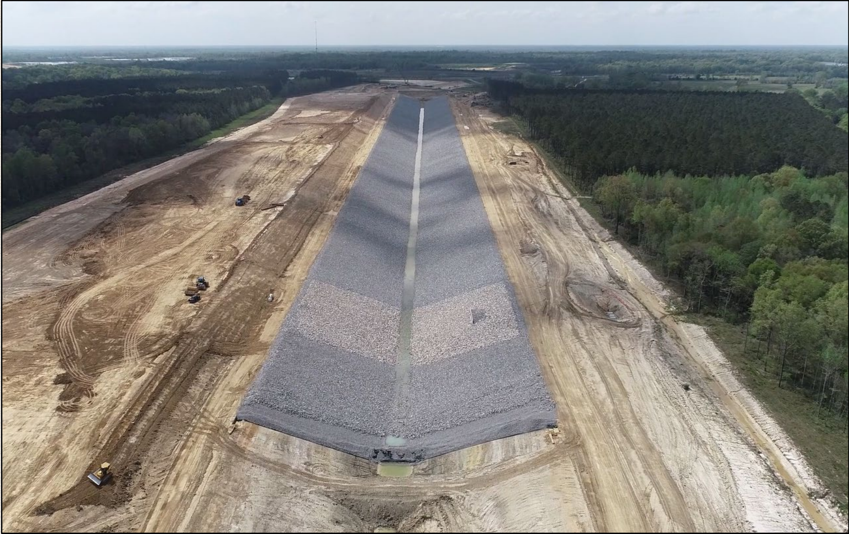
Channel Segment 4 Construction